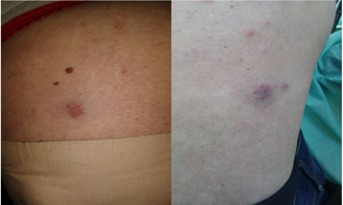
Figure 1. Erythematous-to-violaceous, edematous, inflammatory, and tender papules and plaques on both thighs