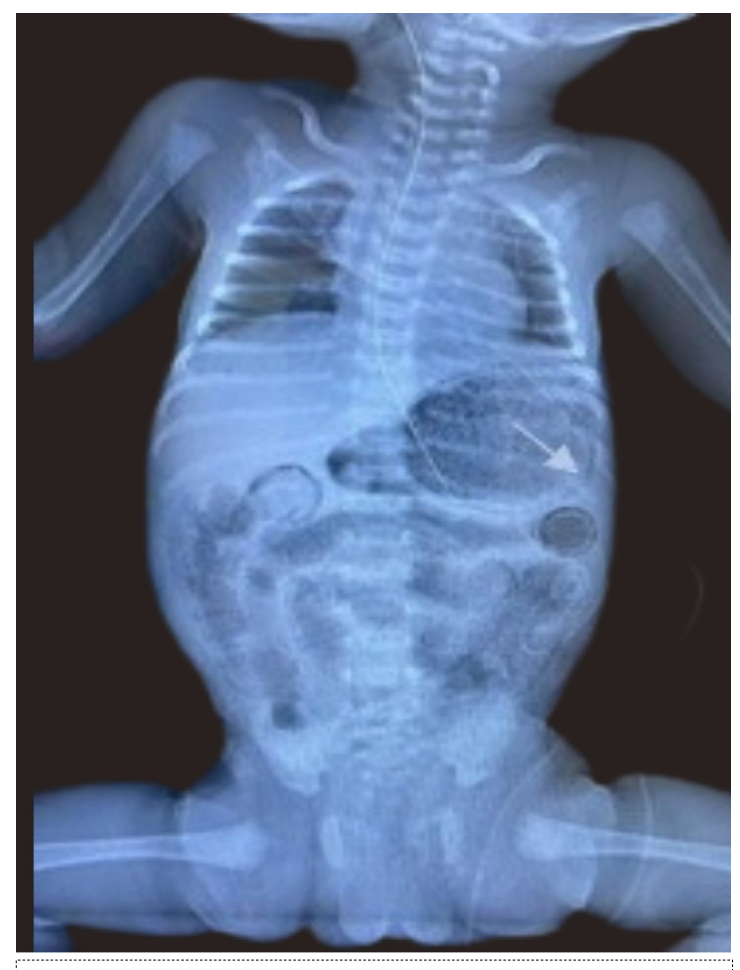
Figure 3. Anterior posterior Chest and abdominal radiograph showing gastric pneumatosis (arrow shown) and pneumatosis intestinalis.

14.3 g/dL. She remained NPO and received triple therapy for 14 days. Thrombocytopenia resolved. All cultures done were sterile. She recommenced feeds on Day 18 of life, subsequent to a repeat A-XRAY which confirmed radiological resolution of NEC. She subsequently had an uncomplicated outcome and was notably thriving when reviewed one month post discharge.