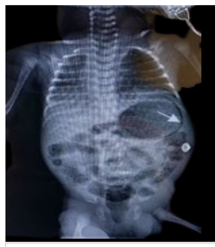
Figure 1. Anterior posterior abdominal radiograph showing gastric pneumatosis (arrow shown) and pneumatosis intestinalis