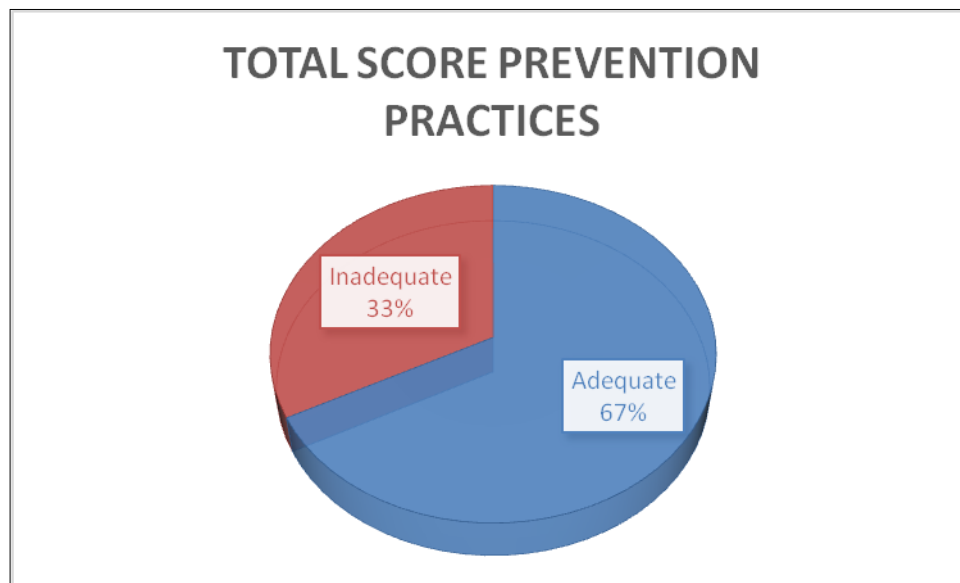
Figure 2. Total score about women prevention practice